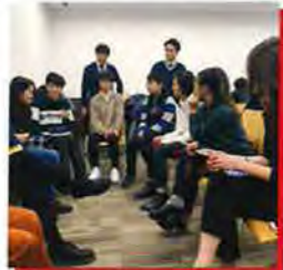
High school Students Discussion Session