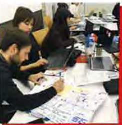
Group Work & Production